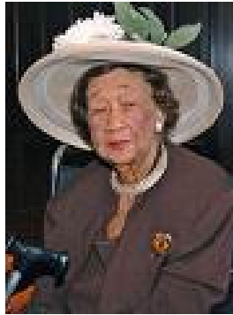
Dorothy I. Height